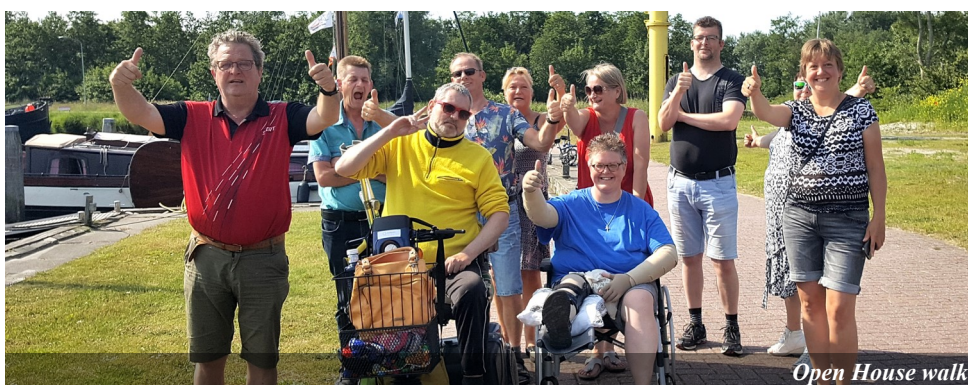
Open House walk

ships, through which we can show something of what life with Jesus means for us.