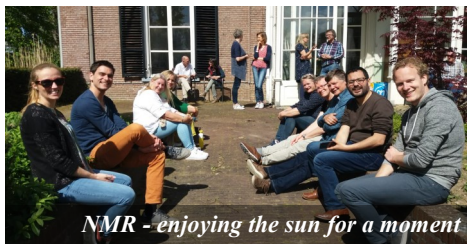
NMR - enjoying the sun for a moment