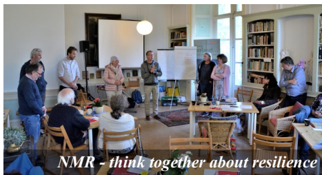
NMR - think together about resilience