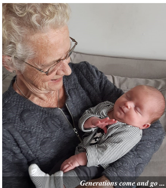
Generations come and go ...